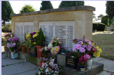
Memorial Wall ~ Rushden Cemetery

We will advise you of all the local cemetery and churchyard regulations to ensure that your proposed memo- rial meets the necessary regulations.