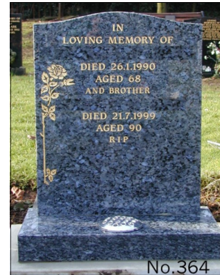
Light Grey Granite

A. Abbott & Sons Bedford Road Rushden Northants NN10 0LZ