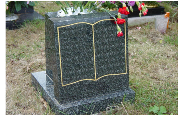
Granite Cremated Remains Grave Headstone

Because you will normally have a choice of materials to use for your memorial it's price will vary. Granite is more expensive than Marble, for example. But it would be true to say that the most expensive memorial is not always the right thing to choose. We therefore will offer you a great variety of memorials from simple small slate grave markers, through to stone vases, headstones and special kerb sets.