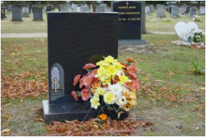
Fully polished Granite headstone with graphic

At A. Abbott & Sons we feel that it is very important to give you all the time you need in choosing a headstone or memorial.