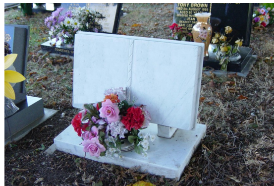
White Marble small book headstone

With memorials for cremated remains graves, they can be ordered without any delay, because the grave would normally be settled by the time the stone was ready to be fixed.